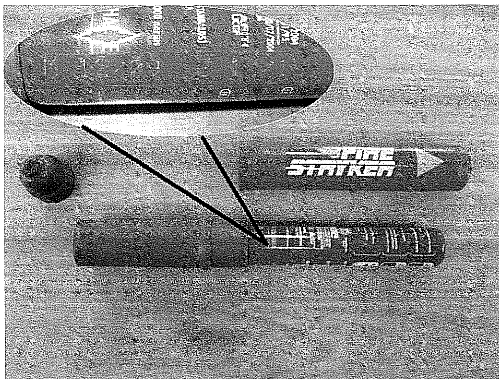
Fig. 1 – Flame Inhibitor